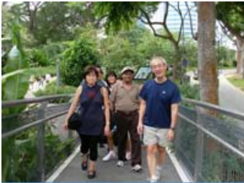
A walk in the park - 12/07/09