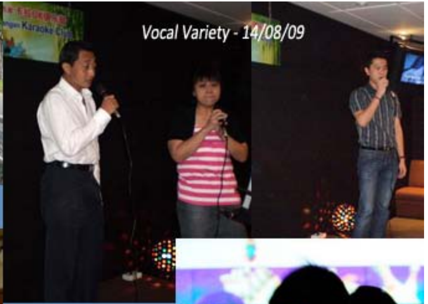
Vocal Variety - 14/08/09