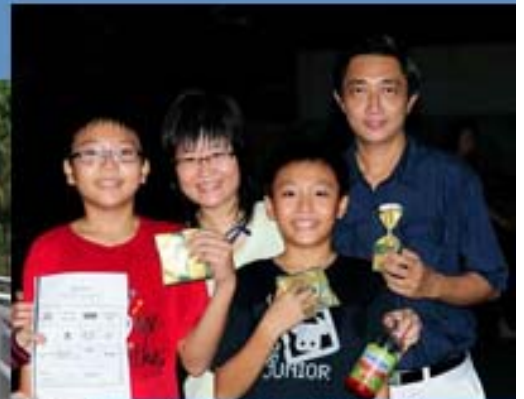
Brains-in-Law - 12/09/09