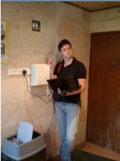
Caught between a rock and a hard place 13/06/09

Note: Visit the photo gallery in our website to view more photos.