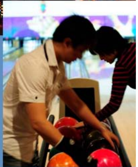
Locking horns at the alley - 12/09/09

Note: Visit the photo gallery in our website to view more photos.